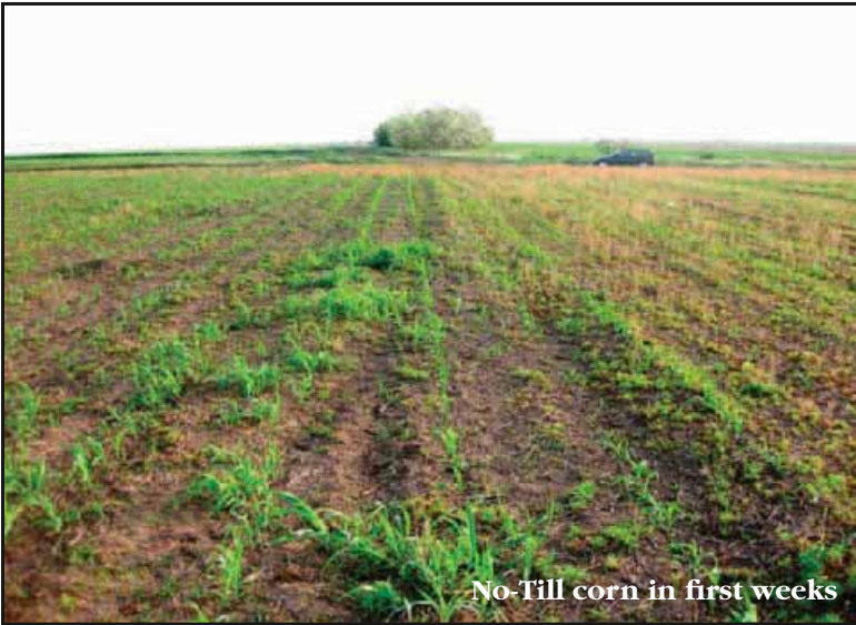
No-Till corn in first weeks

A set of five brochures in very simple language have been prepared for use at the seminars and other places. They are being translated into the Moldovan language. The titles are: