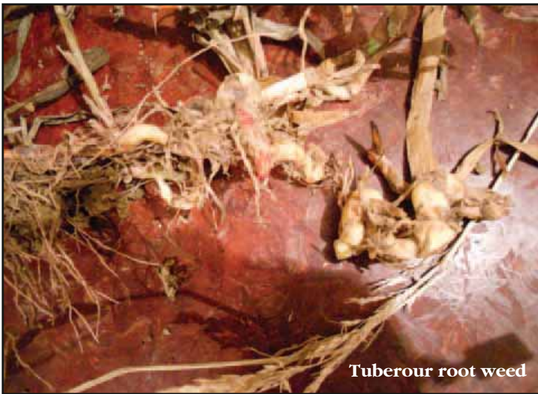
Tuberous root weed